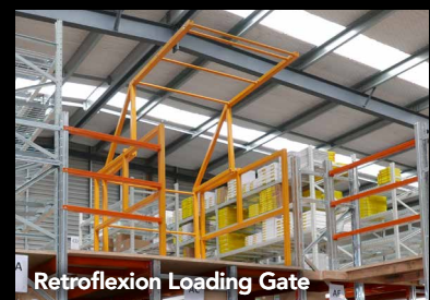
Retroflexion Loading Gate